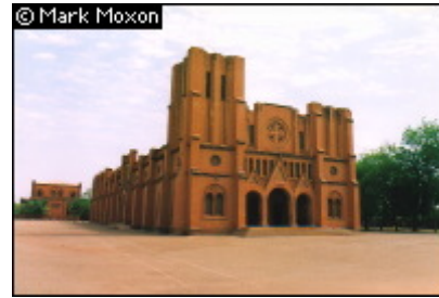
Ouagadougou Cathedral looks like it's been neatly beheaded by an aeroplane

On a walk from the Fondation Charles Dufour to the other side of town, I started jotting down a list of all the different shops I passed en route . I ran out of space after a few blocks, but what I saw was fascinating. Just round the corner from the hostel sits a quincaillerie with white porcelain toilets stacked in piles of three, propped up by bags of cement and surrounded by electric fans and plastic garden seats. A photo booth next door offers instant passport photos and film developing, despite the almost totally empty interior making it look more like the after-effects of a recession; it appears to be business as usual, though.